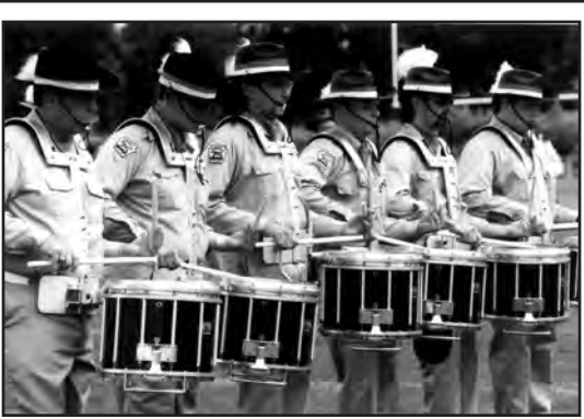
HANOVER LANCERS ALUMNI, Hanover, PA (2000).

Coupled with the weight of their performers' experience and talent, they are collectively a sight sure to make any drum and bugle corps fan think fondly of the activity's proud heritage.