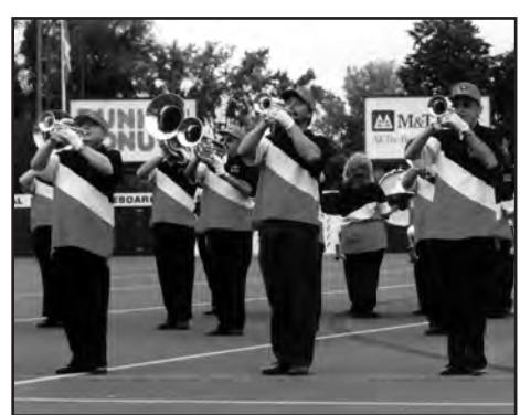
SYRACUSE BRIGADIERS ALUMNI, Syracuse, NY (2000).