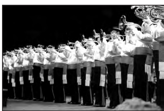
HAWTHORNE CABALLEROS ALUMNI, Hawthorne, NJ (2001).