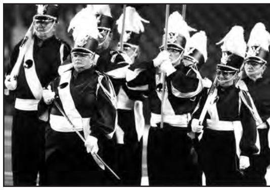
MIGHTY ST JOE'S ALUMNI, LeRoy, NY (2001).