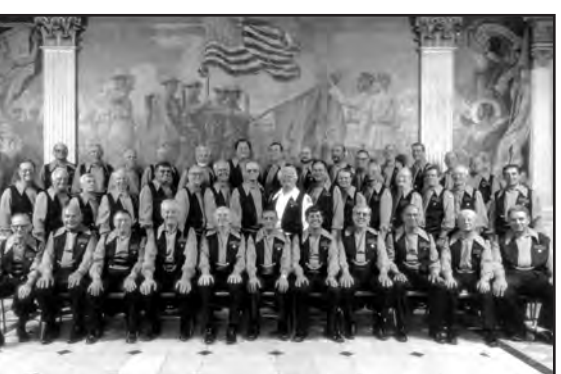
LT. NORMAN PRINCE CHORUS, Melrose, MA (approx. 1982).