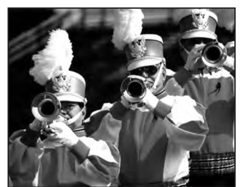
YANKEE REBELS, Baltimore, MD (1998).