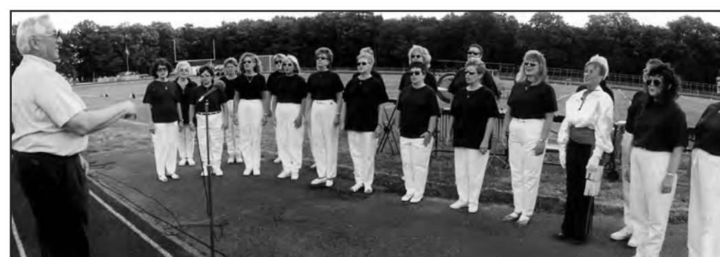
BON BONS CHORUS, Audubon, NJ (2000).