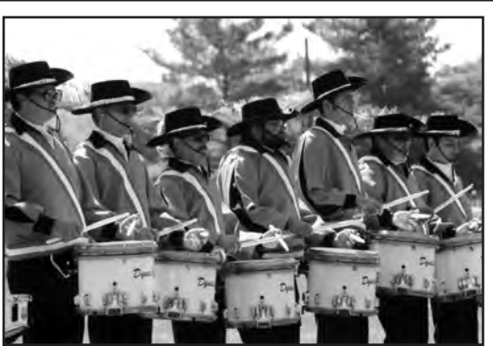
BUCCANEERS ALUMNI, Reading, PA (1998).

The competitive focus rests with the Thunderbirds' intent on winning DCA Mini-corps Championship titles each year. The