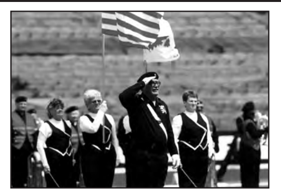
BOSTON CRUSADERS SENIOR , Boston, MA (2001).