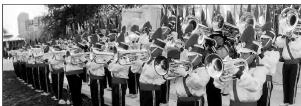
ST. KEVIN'S EMERALD KNIGHTS ALUMNI, Dorchester, MA (2001)